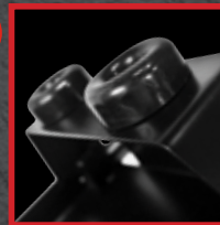
New Foot Design