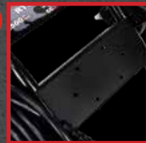
Hose Reel Base Plate

This innovative line of CC2 Pressure Washers are equipped with premium components assembled together on the re-designed Convertible Cart 2!