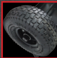
10" Pneumatic Wheels