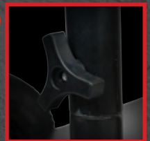
Easy Handle Assembly