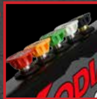
Five Spray Nozzles