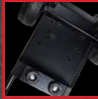
Fully Welded Chassis